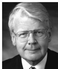
ÓLAFUR RAGNAR GRÍMSSON President of Iceland Honorary doctor