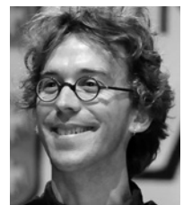
FRED PELLERIN Singer, songwriter, performer and writer Honorary doctor of Letters