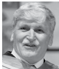
HONOURABLE ROMÉO A. DALLAIRE Retired senator and humanitarian Honorary doctor